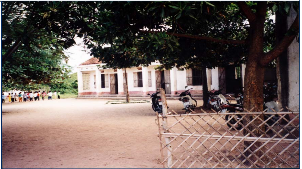
Binh Dan Commune school, Van Don district

pictures and words in accordance with the regulated renovation of textbooks for pupils at grade six. Therefore, the course is easy to teach and the lessons are easy for pupils to understand. For a year, the EE program in the five communes of the buffer zone has gained encouraging results which are worthy of efforts made by the program practitioners. Indeed, local pupils are very delighted with the lessons on EE. Thus, initial results of the program have been recorded after being implemented as an experiment in the communes. At present, the pupils have become aware of leaving litter, and understand how to properly treat litter. As a result, their school playgrounds and classrooms are kept clean; trees are cared for; and water is used in an economical and hygienic way. According to a plan, in the school-year of 2003 – 2004, the EE program will be carried out on a large scale, focusing on pu-