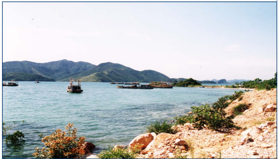
Fishing boats anchored off Minh Chau commune

The aim of the newsletters is to enable the National Park Authority to provide regular information to the people of Bai Tu Long Bay.