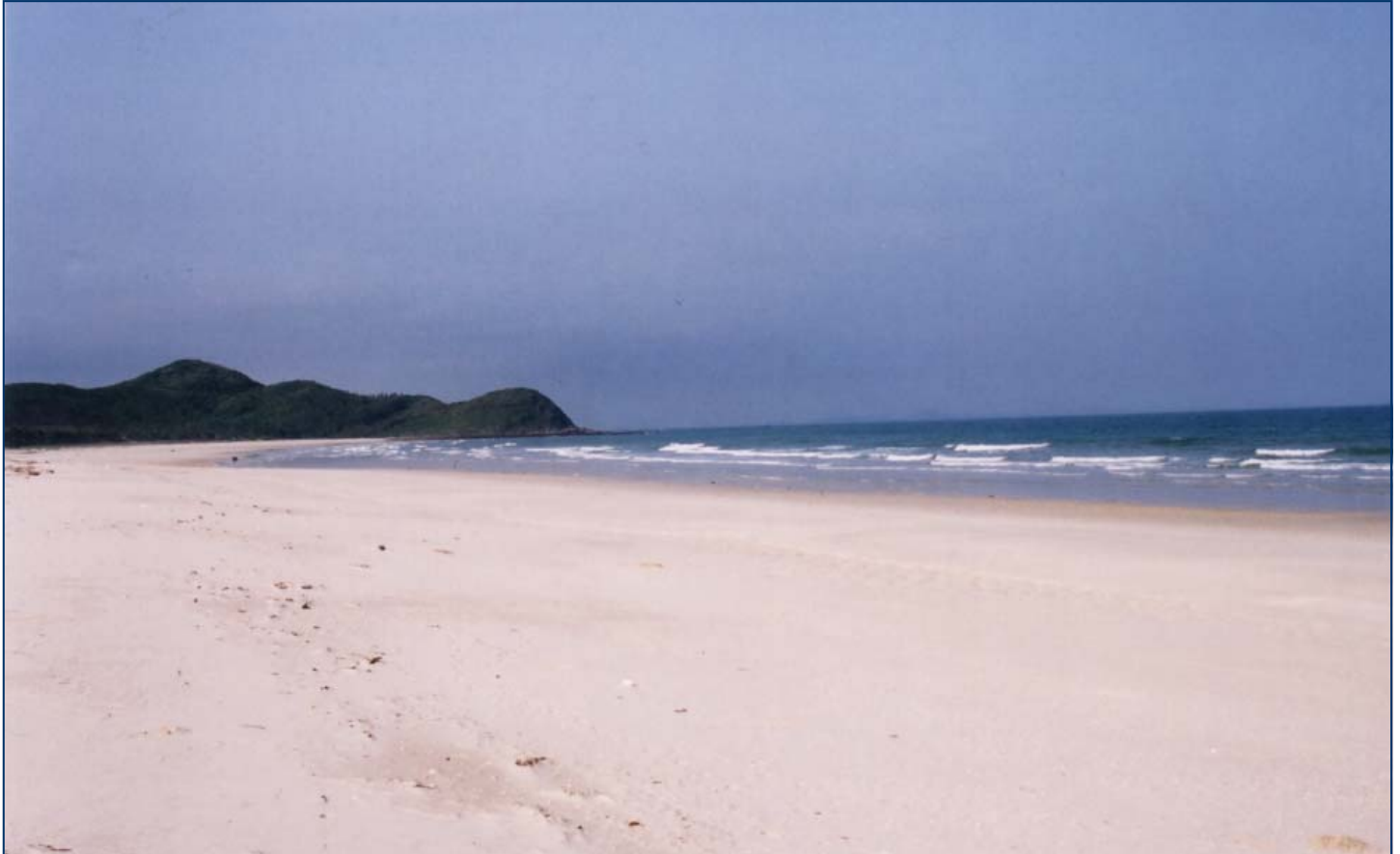
Quan Lan beach