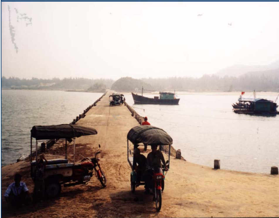
Quan Lan harbour