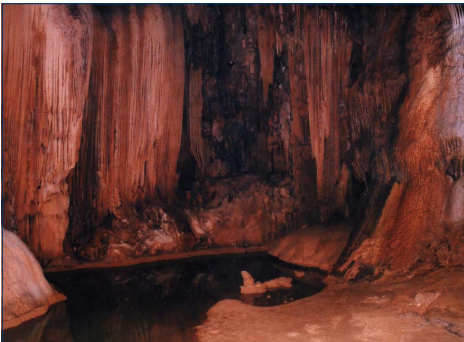
Co Tien cave on Ban Sen island

The participants were senior representatives from Bai Tu Long National Park; Van Yen, Quan Lan, Ban Sen and Minh Chau com-