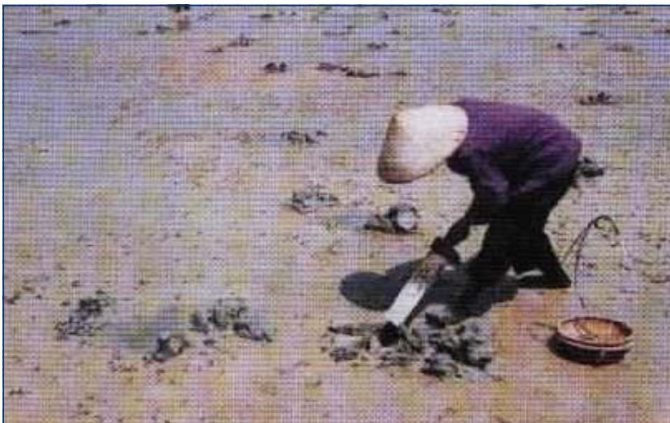
Collecting sea worms is a complicated business

Catching sea worms requires speed and stealth because they live 20 cm to 30 cm under the ground. When discovering the noise of humans or animals of other species,