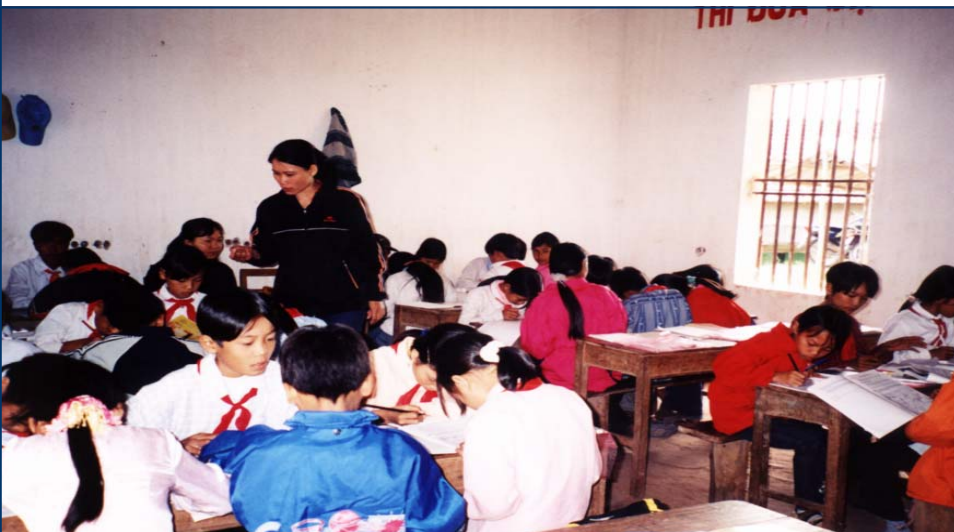
Group discussion in an EE lesson at Dai Xuyen school

Project, which is implemented by Frontier – Vietnam in coordination with the Education Department of Van Don District and Bai Tu Long National Park, launched a pilot environmental education program (EE program) focused on pupils at grade six in Bai Tu Long national park's five buffer zone communes; Ha Long, Van Yen, Ban Sen, Minh Chau, and Quan Lan. With great efforts made by local teachers and leaders of the Education Department of Van Don District and two project officers, the first publication of a textbook on EE for children at grade six has been successful. Eight lessons included in the textbook were scientifically compiled with vivid (continued on page 12)