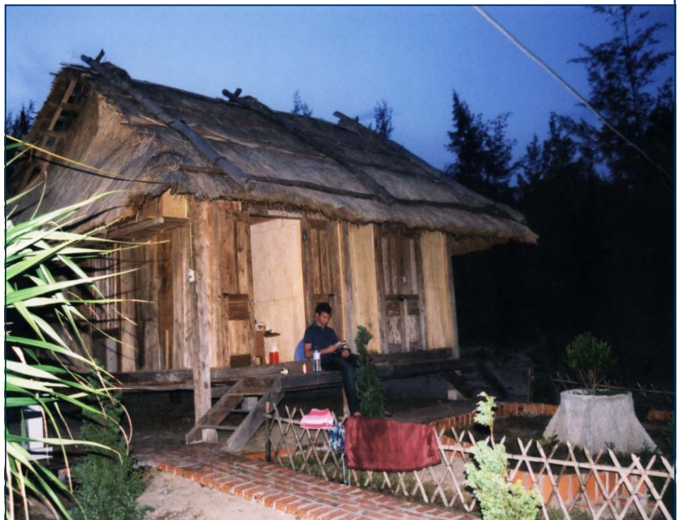
Ecotourism site on Quan Lan beach

proper policies and guidance from provincial, district and commune authorities, and that a prosperous local economy, better cultural life, and stable local security and defence are prerequisites of development.