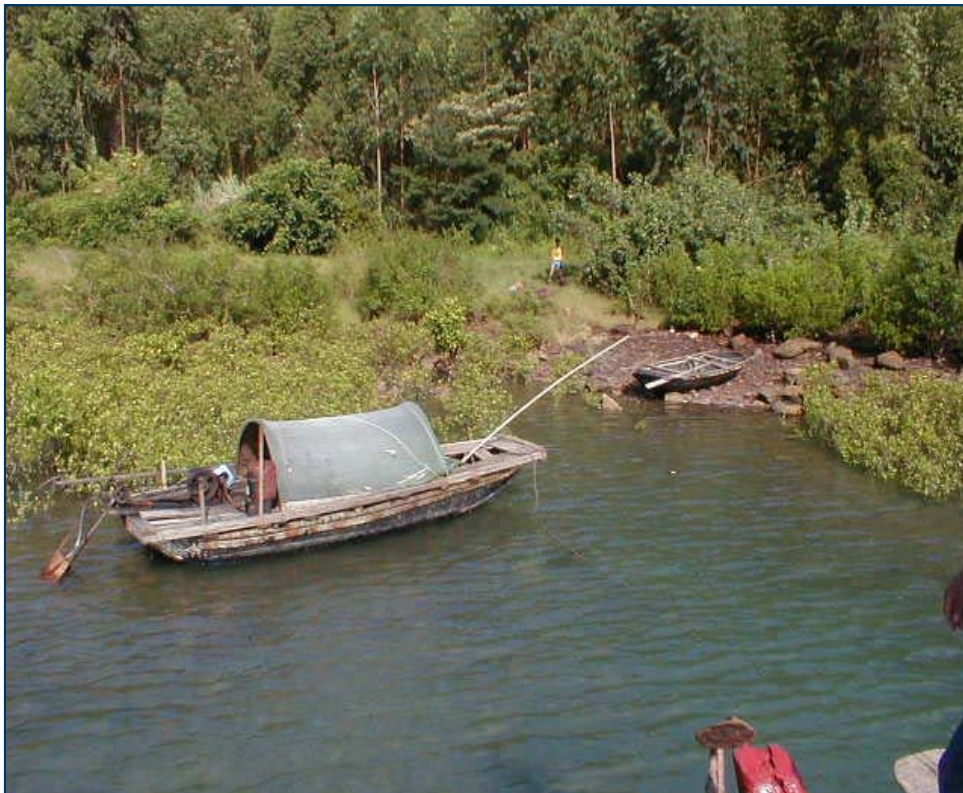
Ba Mun island could become an important eco-tourism site

According to the project, the enterprise that leases the forest environment of Bai Tu Long National Park is the Dinh Vang Company which will use the forest environment as a location to carry out eco-tourism activities and pay a specific amount of money as fees to Bai Tu Long National Park. Bai Tu Long National Park will make a specific plan to effectively spend these funds on protecting the forest, local marine areas, and natural resources in the Park, and coordinate with environmental education projects focussing on local