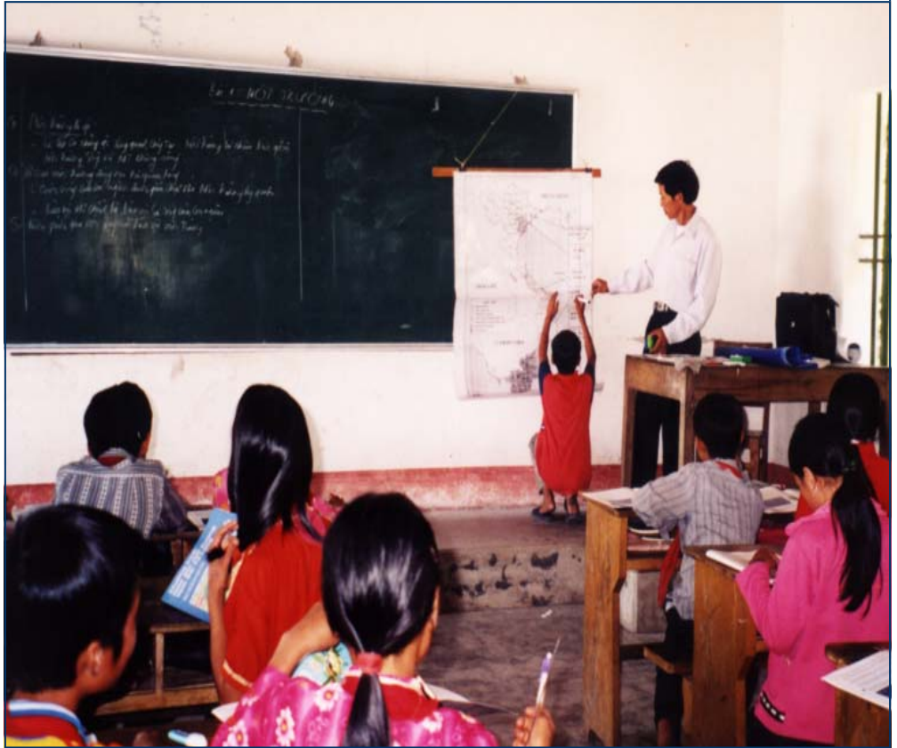
Environmental education lesson at Van Yen school

Nature has endowed Van Don district with wonderful natural landscapes which include Minh Chau, Quan Lan and Ngoc Vung biches with fine sand, blue sea and forest and the beautiful Bai Dai tourism area. The beauty of Van Don island district will become dreamlike when the construction of Van Don bridge is completed. Additionally, nature has donated considerable aquatic resources to the people of Van Don, which has helped stabilize their lives. Therefore, the local people understand the importance of the protection and preservation